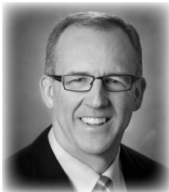
GREG SANKEY Commissioner