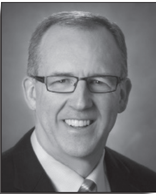
Greg Sankey Commissioner Southeastern Conference

Greg Sankey became the eighth Commissioner of the Southeastern Conference on June 1, 2015, and immediately embarked on a journey to build upon the SEC's recognized success, strong foundations and rich traditions.