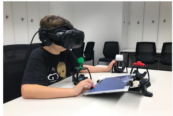
Figure 2: Study setup: a child is wearing VR glasses as an instantaneous output for the input provided by tangibles and a tablet. New virtual objects are created by placing tangibles on the tablet surface and can be modified via touch input.

Trajectory creation. We employed trajectory creation to allow the movement of virtual objects on the 2D surface. With this, we aimed to showcase one possibility to interact with dynamic elements in VR. In the trajectory mode, the object starts moving with a constant speed when a finger is released from the touch surface after drawing a trajectory. A user can start drawing a trajectory by touching anywhere on the surface. This mode also allows a simultaneous movement of multiple dynamic objects. For example, a user selects a car in the virtual scene, draws a trajectory for it and it starts moving in the scene. While the first car is moving, a user can select another car and specify a second trajectory and let the car move. One object is, however, restricted to a single trajectory. If users want to change an existing trajectory, they have to draw another trajectory for a selected object and the previous trajectory will be deleted. The trajectory is visually depicted in the scene and disappears when a dynamic object finishes the trajectory. Given that the trajectory is connected to the world, it moves together with it in the scene control mode.