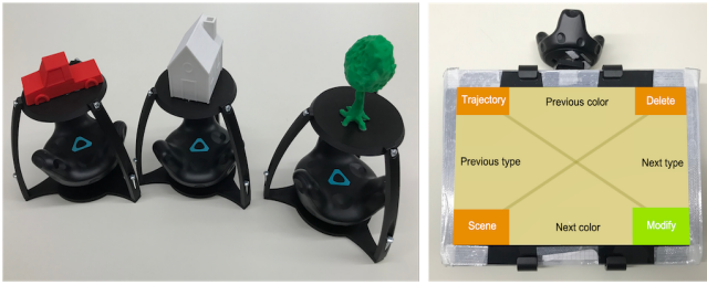
Figure 1: Inputs of the VRtangibles: three tangible objects on the 3D-printed platform (left) and a tablet as an interaction surface (right). The tablet is overlaid with a VR interface. The tangible objects and a tablet are tracked in the virtual space using VR trackers.

3.1.1 Tangible Objects. We employed tangible objects due to their learning benefits. As pointed by Klahr et al. [22, 23], using physical objects in a learning task might change the nature of the knowledge relative to that gained through interaction with virtual objects. Moreover, 3D shapes might ease the perception and understandability through the haptic and proprioceptive perception of tangibles compared to visual representation alone [14, 25]. Thus, we implemented the following interaction with tangible objects while creating virtual scenes.