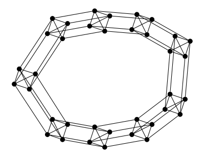
Figure 3: Illustration of the construction of the graph G, where d-1=4 and n/(d-1)=9, so n=36.

d-regular graph G. First take n/(d-1) disjoint cliques of size d-1 and arrange them in a cycle. Then connect two cliques which are next to each other in the cycle by d-1 vertex-disjoint edges. This way we obtain a d-regular graph, which can be also defined as the Cartesian product of a cycle of length n/(d-1) and a clique of size d-1.