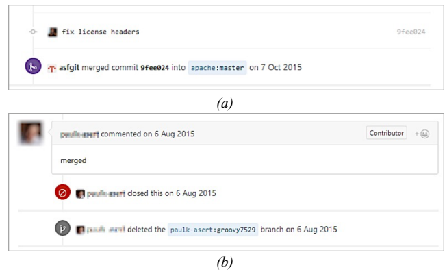
Fig 2. Two examples of pull requests: one merged in GitHub (a), the other one merged outside GitHub and closed (b).

The results of the analysis are reported in Table 3, where we omit to report the positive and significant effect of control variables #PRs reviewed and #emails sent due to space constraints. Regarding the predictor Propensity to trust, we note that the coefficient estimate (+1.49), the odds ratio (4.46), and the statistical significance (p-value = 0.009). The sign of the coefficient estimate indicates the positive/negative association of the predictor with the success of a pull request. The odds ratio (OR) weighs the effect size of this impact: the closer its value to 1, the smaller the impact of the parameter on the chance of success. A value lower than 1 corresponds to a negative association of the predictor (negative sign of the coefficient estimate) with success, and the opposite