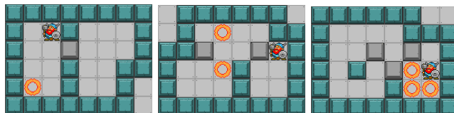
Fig. 1: Examples of Sokoban levels. The player (dwarf avatar) must push all boxes (grey blocks) into the targets (orange circles) to complete the level.

performance only temporarily. In addition, even one game tick provides a large number of training samples.