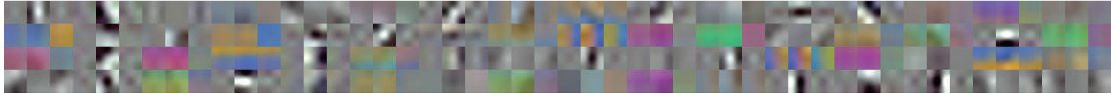
a) C3D conv1a filters