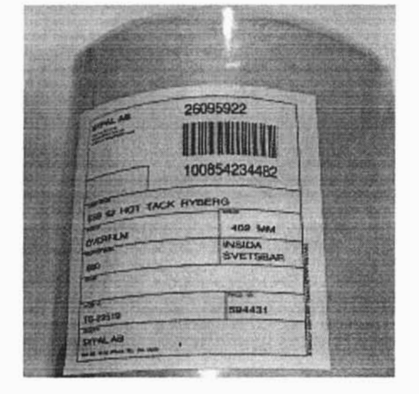
Figure 1. An example image of an application situation.