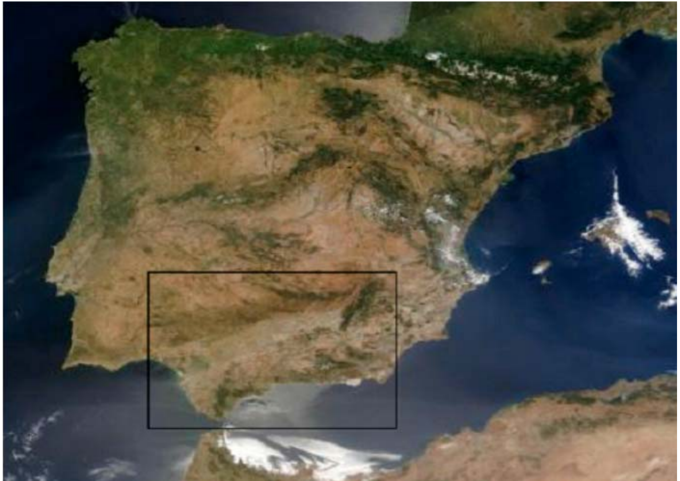
Map 2. Location of Andalucía in Spain. Source: [26]. Adapted in-house.

As stated earlier, this study of external economies that can be exploited from within the territory has mainly been conducted in light of two key concepts: the cluster – “a geographically proximate group of interconnected companies and associated institutions in a particular field, linked by commonalities and complementarities” [26, p.15]; and the industrial district – “a socioterritorial entity which is characterised by the active presence of both a community of people and a population of firms in one naturally and historically bounded area. In the district – unlike in other environments, such as the manufacturing town - the community and the firms tend, as it were, to merge” [36, p.9]. Both concepts came about in an attempt to understand the industrial reality that is found in specific locations. However they have also been applied in the agri-industrial field, as outlined at the beginning of this article, as they are used to analyse activity within a territory and can therefore go beyond the industrial realm, to include both services and agrarian activity.