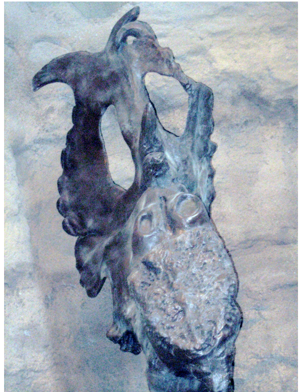
Figure 1: A deformed dinosaur skull in the Carnegie Museum of Science, Pittsburgh.

Under the assumption that the object was compressed , we assume that the inverse deformation should be what we call a single axis stretch . A single axis stretch is produced by choosing a direction vector and scaling only in that direction; it is represented by a symmetric matrix A for which two of its eigenvalues are one and the third is greater than one. Single-axis stretches are important, since the simplest hypothesis for how a