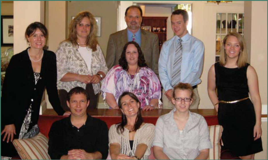
Our largest special event is our Annual Benefit Auction – and we couldn't pull it off without a team of dedicated volunteers.

CCS is a special place, and we accomplish what we do through the combined efforts of those who give their time and energy to make it happen – from our dedicated staff and Board, to the community groups and individuals who volunteer at CCS.