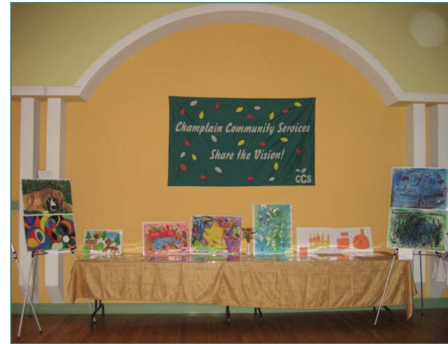
Two events gave the community a chance to see CCS consumer art shows last year. We had an "opening" at the October Appreciation Night, and in March staff & consumers showed – and sold – their work at The beCAUSE Art Show at St. Michael's College.