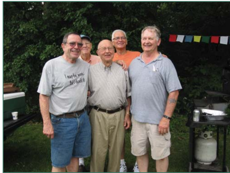
The Colchester Knights of Columbus has sponsored our agency's Annual Picnic each July for the past 15 years, providing food and grilling for us at Oakledge Park.