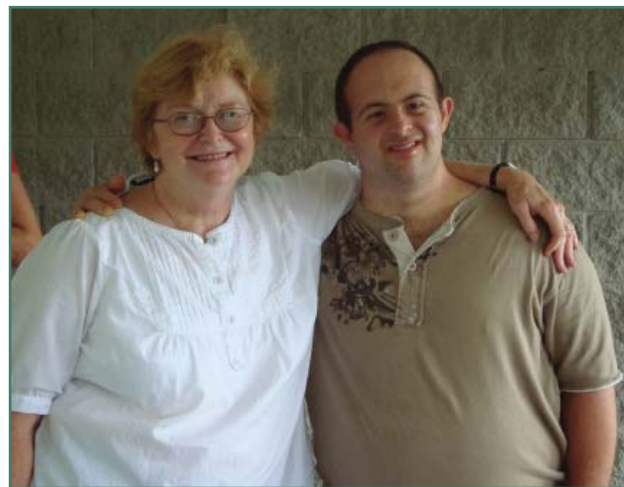
Family members, staff, and friends all look forward to our Annual Picnic, a highlight of the summer!