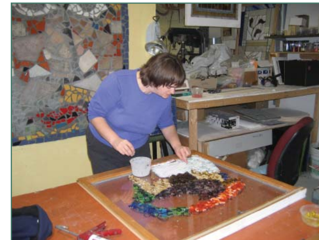
A number of our clients participate in VSA Arts on a regular basis