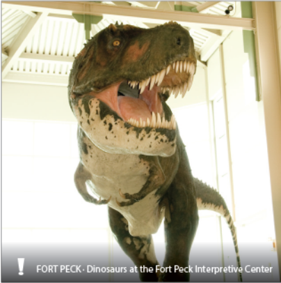
! FORT PECK- Dinosaurs at the Fort Peck Interpretive Center