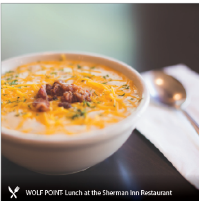
✂️ WOLF POINT: Lunch at the Sherman Inn Restaurant

Enjoy a great dinner and refreshing beverage at The Slipper . 🍷