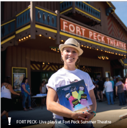
! FORT PECK- Live plays at Fort Peck Summer Theatre

Grab some lunch at Sherman Inn Restaurant . 🍴