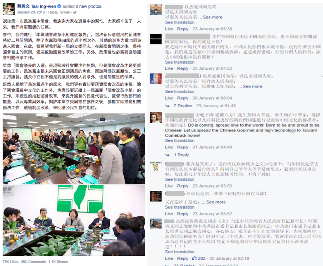
Figure 4: Screenshots of Tsai Ing-wen's First Party Meeting Facebook Post After Being Elected President in 2016.