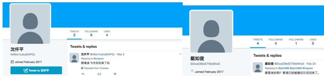
Figure 2: Screenshot of Suspicious Accounts on Twitter