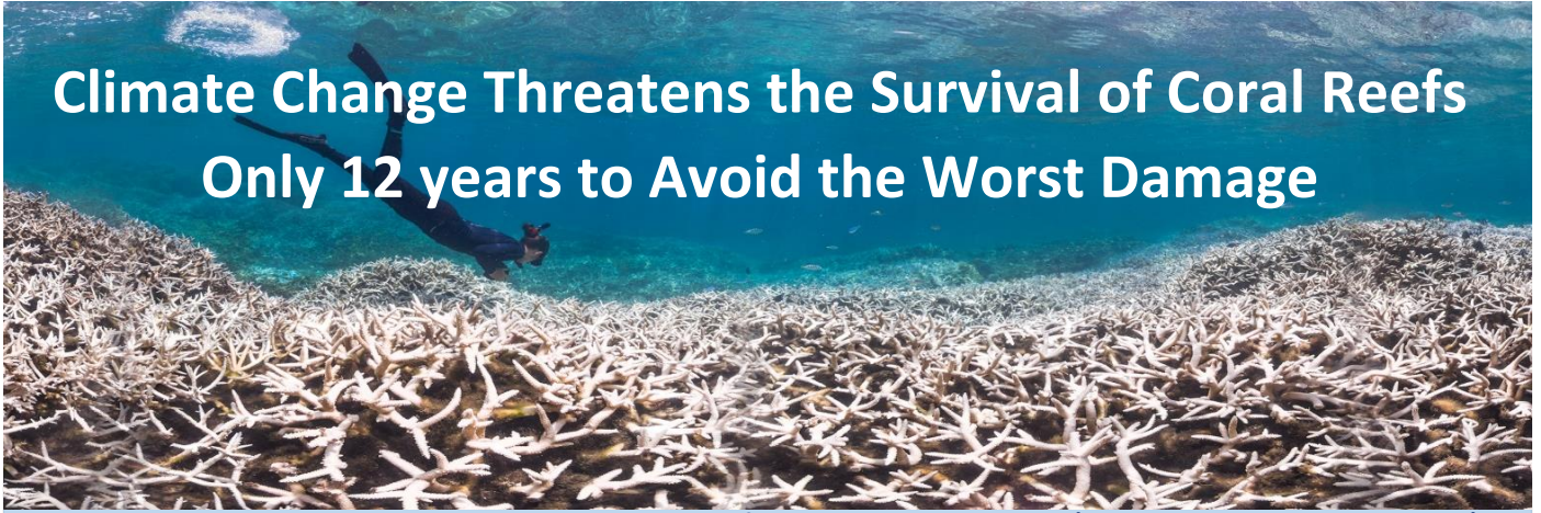
Bleaching coral reef in American Samoa, 2015

Coral reefs are structures created by coral animals and are among the most biologically diverse ecosystems on the planet. They provide goods and services worth at least US$11.9 trillion per year and support (through such activities as fisheries and tourism) at least 500 million people worldwide. Potent anti-cancer drugs have been derived from coral reef organisms, and others are in testing; healthy coral reefs could save millions of lives.