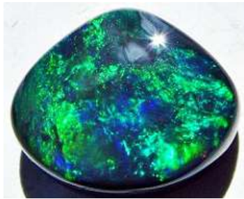
Figure 11 Black opal from Lightning Ridge, Australia

Opal is culturally important to Australia; it was declared the country's national gemstone in 1994. Black opal is also the state emblem of NSW, with white opal holding the same position for the state of SA. Although Australia is home to several notable gemstones, including extremely rare pink and red diamonds, 206 and blue sapphires, opals remain synonymous with the country, particularly for tourists (primarily those from China