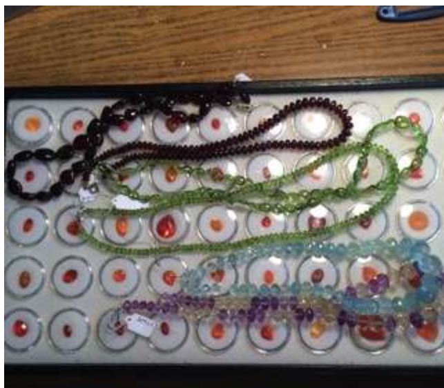
Figure 7 Loose Ethiopian fire opals beneath a selection of gemstone jewellery made in Addis Ababa

Another issue at play here is the fact that jewellery set with small gemstones is likely