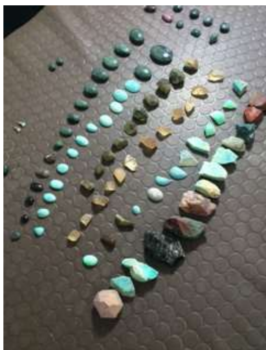
Figure 6 Assortment of polished and rough low value, high volume Ethiopian gemstones

These efforts were coupled with a desire to advertise Ethiopia's gemstones to the