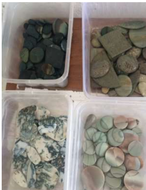
Figure 9 Stones cut and polished by women in ASM communities

Interviews with international gem traders showed how well Ethiopian opal is received on the international market, on account of its high quality but lower price point (compared to Australian opal). Further to the previous recommendation regarding