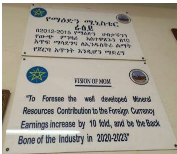
Figure 2 The Ministry of Mines' vision

The lower price garnered for rough on the international market also meant that exporting rough opal, as opposed to the more expensive polished opal, was preventing Ethiopia from building its foreign currency reserves at a faster pace. This latter point was of particular significance to the MoMPNG, whose advertised mandate includes working to ensure that Ethiopia's minerals industry increases by tenfold (from 2015) its contribution to the nation's foreign currency reserves by 2020 to 2023 (see Figure 2 37 ).