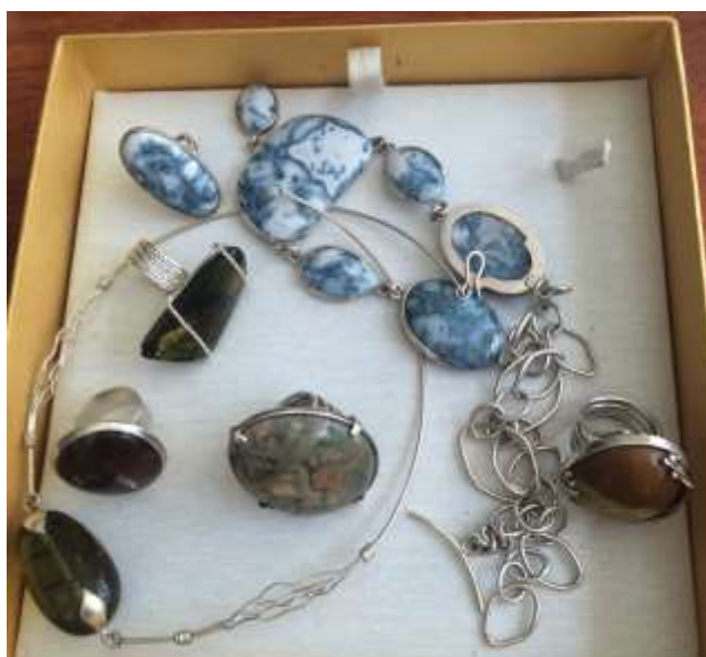
Figure 8 MANALE jewellery sample

Dagnev is therefore aspiring to achieve with this business the kind of domestic beneficiation that the 40:60 rule was intended to enable; indeed she advised the government on the rule's introduction.