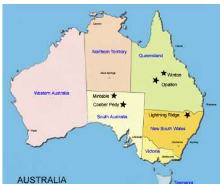
Figure 10 Known major opal deposits in Australia

Opal has been mined in Australia for over 100 years, exclusively by small-scale miners—there are no large-scale companies operating in the upstream sector.