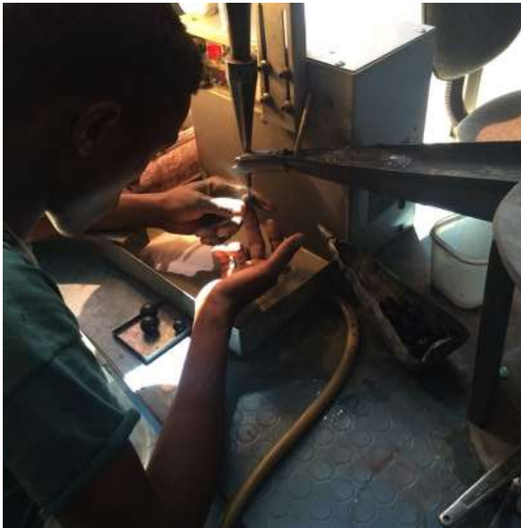
Figure 3 Gemstone bead drilling in Addis Ababa 72

In contrast to the ease with which lapidaries can meet legal requirements, setting up an operational lapidary business was reported as being extremely challenging by all interviewees. The most commonly reported challenge was finding sufficiently trained staff for cutting and polishing gemstones, and then further training them in order to bring their skill levels up to an internationally competitive standard. It was a common complaint of interviewees that the cutters and polishers they have hired are not producing to a high enough standard, even though the majority have received training in the Amhara region's gemstone cutting and polishing training centres.