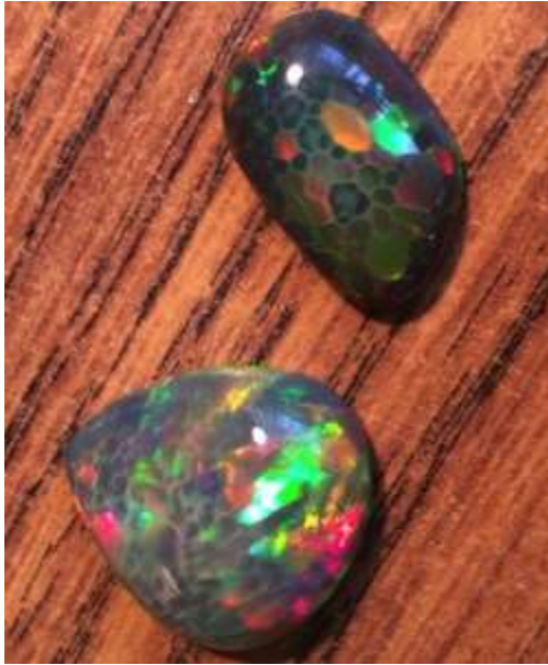
Figure 5 Polished black opals said to have been mined in Ethiopia

However, the pervasiveness of gem treatments arguably means that what could be legitimate black opal deposits (the researchers were not able to confirm if these opals came from the same deposit identified by the GIA in 2014 95 ) are almost by default presumed to be 'fraudulent' by some international buyers, and indeed, some members of Ethiopia's gemstones sector, despite the fact that locally-performed treatments are said to be rare. The prevalence of undisclosed gemstone treatments therefore effectively places a veil of uncertainty over the whole industry in relation to (potentially) new opal discoveries.