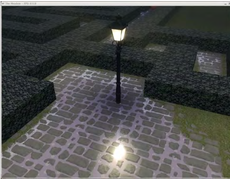
Fig. 8 Achieving a mirror effect by rendering the geometry twice [5].

The modern real-time graphics pipeline does not deal with the visual representation of transparency, reflection or refraction and their emulation must be dealt with using special cases or tricks. Traditionally, transparency has been emulated using alpha blending [1], a compositing technique where a ‘transparent pixel’ is combined with the framebuffer according to its fourth colour component (alpha). The primary difficulty with this technique is that the results are order dependent, which requires the scene geometry to be sorted by depth before it is drawn and transparency can also present issues when using deferred shading [58]. A number of order-independent transparency techniques have been developed, however, such as depth-peeling [53, 132].