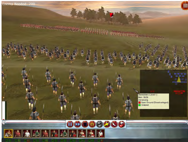
Fig. 6 Great Battles of Rome.

The game's historical context was introduced in a long (animated) introduction, depicting the geo-political situation of the period and the events leading up to the outbreak of war in 1914. In between battles the player is provided with additional information on concurrent events that shaped the course of the conflict, which is illustrated with animations and newspaper clippings from the period.