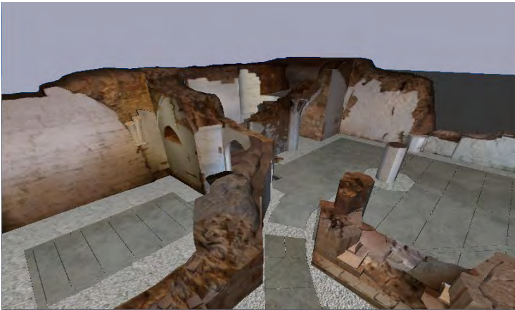
Fig. 5 Priory Undercroft – a Serious Game

Furthermore, a first version of a serious game (Figure 5) has been developed at Coventry University, using the Object-Oriented Graphics Rendering Engine (OGRE) [198]. The motivation is to raise the interest of children in the museum, as well as cultural heritage in general. The aim of the game is to solve a puzzle by collecting medieval objects that used to be located in and around the Priory Undercroft. Each time a new object is found, the user is prompted to answer a question related to the history of the site. A typical user-interaction might take the form of: "What did St. George slay? – Hint: It is a mythical creature. – Answer: The Dragon", meaning that the user then has to find the Dragon.