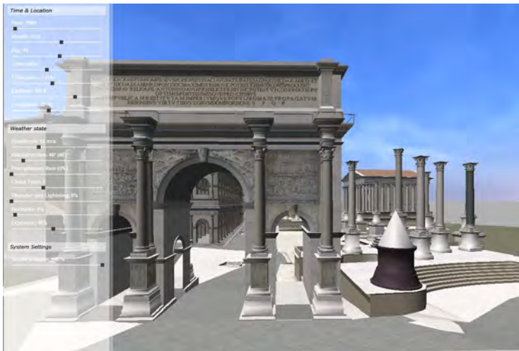
Fig. 1 ‘Roma Nova’ - Experiencing ‘Rome Reborn’ as a game.

The popularity of video games, especially among younger people, makes them an ideal medium for educational purposes [116]. As a result there has been a trend towards the development of more complex, serious games, which are informed by both pedagogical and game-like, fun elements. The term ‘serious games’ describes a relatively new concept, computer games that are not limited to the aim of providing entertainment, that allow for collaborative use of 3D spaces that are used for learning and educational purposes in a number of application domains. Typical examples are game engines and online virtual environments that have been used to design and implement games for non-leisure purposes, e.g. in military and health training [114,204], as well as cultural heritage (Figure 1).