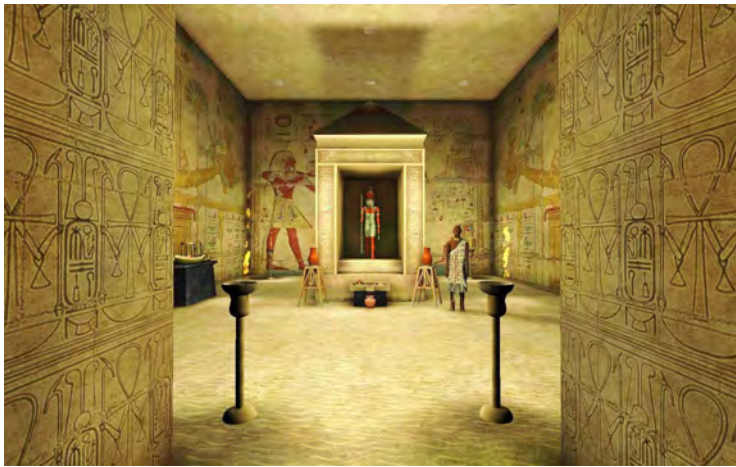
Fig. 3 New Kingdom Egyptian Temple game.

The objective of the game ‘Gates of Horus’ [82] is to explore the model and gather enough information to answer the questions asked by the priest (pedagogical agent). The game engine that this system is based on is the Unreal Engine 2 (Figure 3) [84], existing both as an Unreal Tournament 2004 game modification [194] for use at home, as well as in the form of a Cave Automatic Virtual Environment (CAVE [35]) system in a real museum.