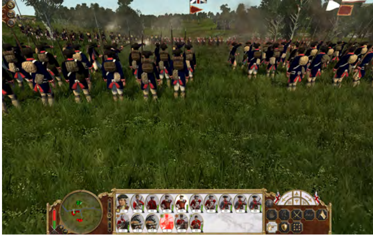
Fig. 7 Reliving the battle of Brandywine Creek [124] in ‘Empire: Total War’.

realistic depiction of history. As a result, games from the Total War series have been used to great effect in the visualisation of armed conflicts in historical programmes produced for TV [196].