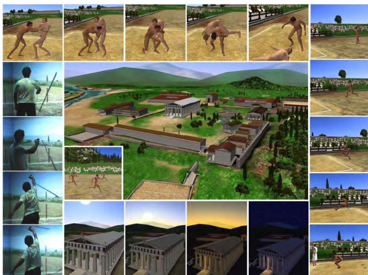
Fig. 4 Walk through Ancient Olympia [66].

ivory and gold plates, apply them onto the wooden supporting core and add the finishing touches. Interaction is achieved using the navigation wand of the Virtual Reality (VR) system, onto which the various virtual tools are attached. Using these tools the user helps finish the work on the statue, learning about the procedures, materials and techniques applied for the creation of these marvellous statues. The last example is the