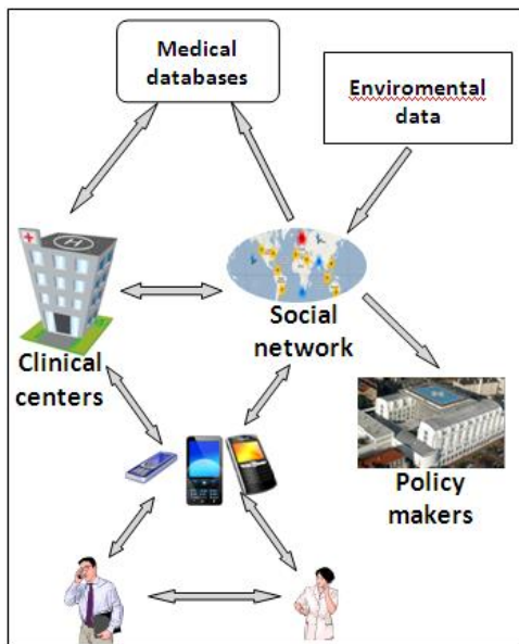
Figure 2. Cohesy collaboration architecture.

At the same time, the patient individual data can be compared with average data obtained using different collaborative filtering techniques.