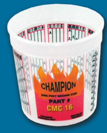
#CMC 16 100/Box #CMC 16L 100/Box

New and Improved with extra features. #CMC24 100/Box #CMC24L 100/Box