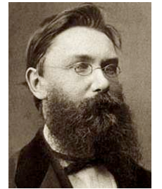
A. Clebsch (1833-1872)