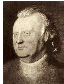
E. Waring (1736-1798)

Tensors have been introduced at the end of the nineteenth century with the development of the differential calculus. They have then been omnipresent in physics, to express laws independently of coordinate systems. Yet, a tensor is essentially a mapping from a linear space to another, whose coordinates transform multilinearly under a change of bases, as subsequently detailed. For an easier reading, we shall resort to arrays of coordinates, when this indeed eases presentation; interested readers may want to refer to [23], [49] for a more advanced coordinate-free presentation.