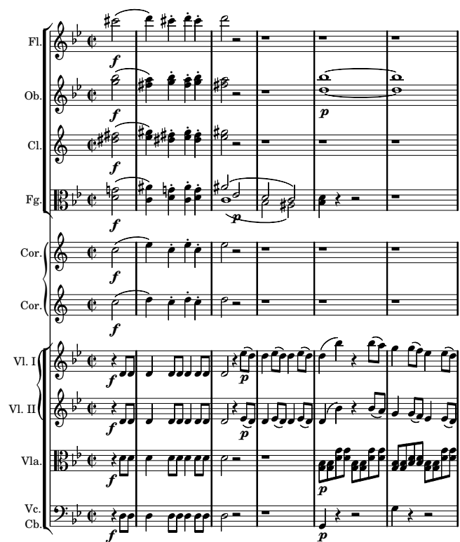
Figure 4: The symphony, measures 17-22

In the more complex Mozart piece, however, we witness that the highest note prediction strategy was outperformed by most of our methods. In the symphony movement the melody is not on top as often. Also, the melody role is taken by different instruments at different times. Figure 4 shows 6 bars (bar 17-22) from the symphony. In the first three, the flute (top voice) was annotated to be the melody, but the melody then moves to the first violin in bar 19. In bar 21 the first oboe enters on a high-pitched long note – above the melody. Such high-pitched non-melodic notes (doubling chord tones) occur frequently in the movement. The H_{C,D} measure cor-