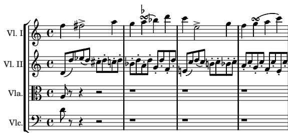
Figure 3: The string quartet, measures 105-108

in the first violin is playing fewer different notes, but has a more varied rhythm. We took a closer look at this passage. Setting the window size to 2 seconds, the measures H_D , H_{CID} , and H_{C,D} recognise the upper voice as melody whereas H_C , H_I , and H_{I,D} suggest the lower. The measures based on intervals are naturally led astray in this case, and the measure based solely on pitch class is also.