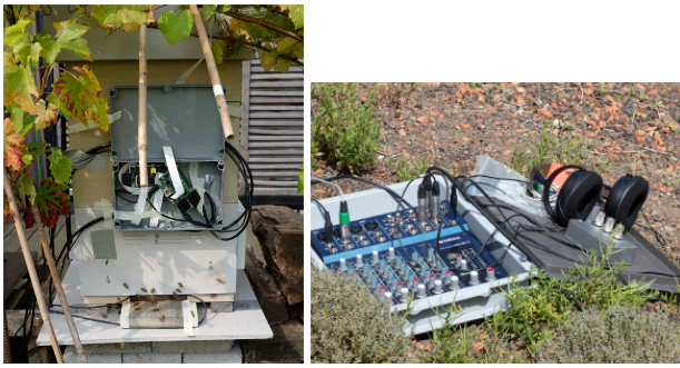
Figure 2: Field recordings. Left: Cameras connected to Raspberry Pi computers film, process and stream the visual data recorded in the hive. Right: Piezo sensors are inserted into the hive, between the comb frames and in front of the entrance on the landing platform. The piezo's are connected to a small mixing panel with amplification.

very original solutions to the challenges that social insects face, e.g. on the level of communication and collective decision making. They are an endless source of visually stunning images and sounds and their remarkable collective behavior provides inspiration and metaphors for the functioning of human society. But in many industrialised nations, bee colonies are now threatened. So I work also towards an improvement of the environment of bees with the creation of urban gardens and guerilla planting and I use bees as bio-indicators to make citizens aware of the increasingly negative effects of our life styles and methods of industrial production.