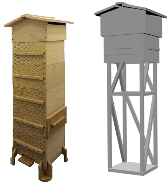
Figure 1: Left. Physical Warré-hive. Right: 3d Model (constructed with Blender) of the Scaffolded Warré hive. The Scaffolded Hive will be digitally fabricated based on this design.

images give a stunning visual experience of a colony in action.