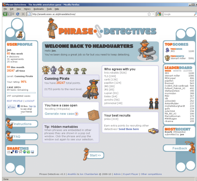
Figure 1: Screenshot of the Phrase Detectives player page.