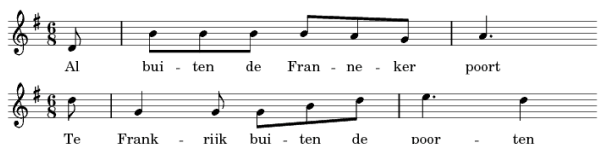
Figure 2. Example of true positive for the query song “In Frankrijk buiten de poorten” (2 nd version) OGL19406 with its NN, OGL41709.