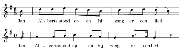
Figure 1. Example of false positive for the query song “Heer Halewijn” (3 rd version) OGL19205 with its NN, OGL19107, instance of “Heer Halewijn” (4 th version).

on weight transportation such that the surplus of weight between two point sets is taken into account.