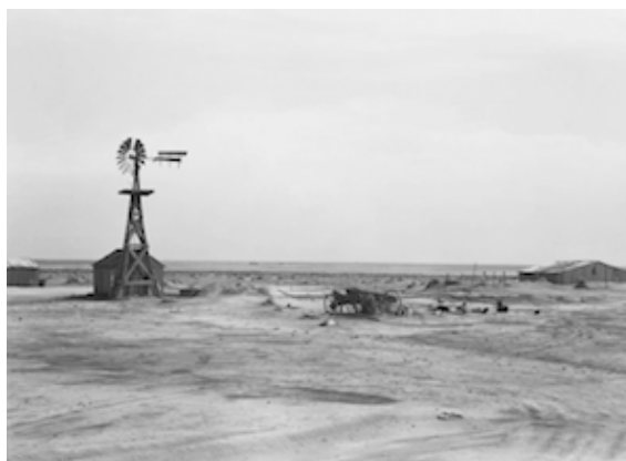
Figure 3b. Another of the photos used by the composer to provide aesthetic inspiration for composing the sonification scheme. Photo Credit: Dorothea Lange (1938), “Abandoned farm with windmill and farm equipment. Dalhart, Texas. June 1938” [19].

pattern (or left-to-right pattern, for 2 speakers), thus generating a “flying-around” of notes.