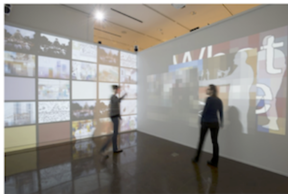
Figure 1. Specter system deployment at Time Jitters exhibit. Photo shows two people moving through the installation. Two of the four speakers are visible (top-left and center). Also visible is one of the two Kinect sensors used in the installation (top right), and one of the four projectors (each projecting to one of the four walls enclosing the installation).

Sound spatialization offers the ability to composers and performers to specify how sounds are positioned in the listener's audio field. Most consumer-quality audio systems allow for stereo fields (i.e., the ability to pan sound from left to right channel), becoming a standard household item in the 1970s. Around the same time, quadrophonic systems were introduced (i.e., making use of 4