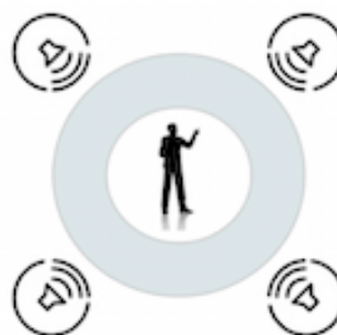
Figure 5. Migrant performance 4-channel speaker arrangement. Audience is seated in the middle. However, a regular two-speaker (stereo) setup is possible (for convenience).