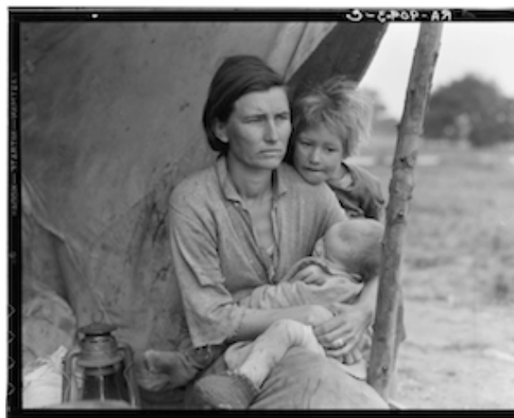
Figure 3a. One of several photos used by the composer to provide aesthetic inspiration for composing the sonification scheme. Photo Credit: Dorothea Lange (1936), “Destitute pea pickers in California. Mother of seven children. Age thirty-two. Nipomo, California” [18].

During the first cycle, the pianist plays the notes in the score verbatim. The computer layers identical notes in a computer-enhanced timbre and diffuses them in a circular