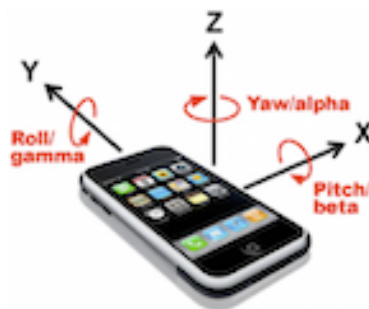
Figure 6. Smartphone Pitch, Roll, and Yaw directions.