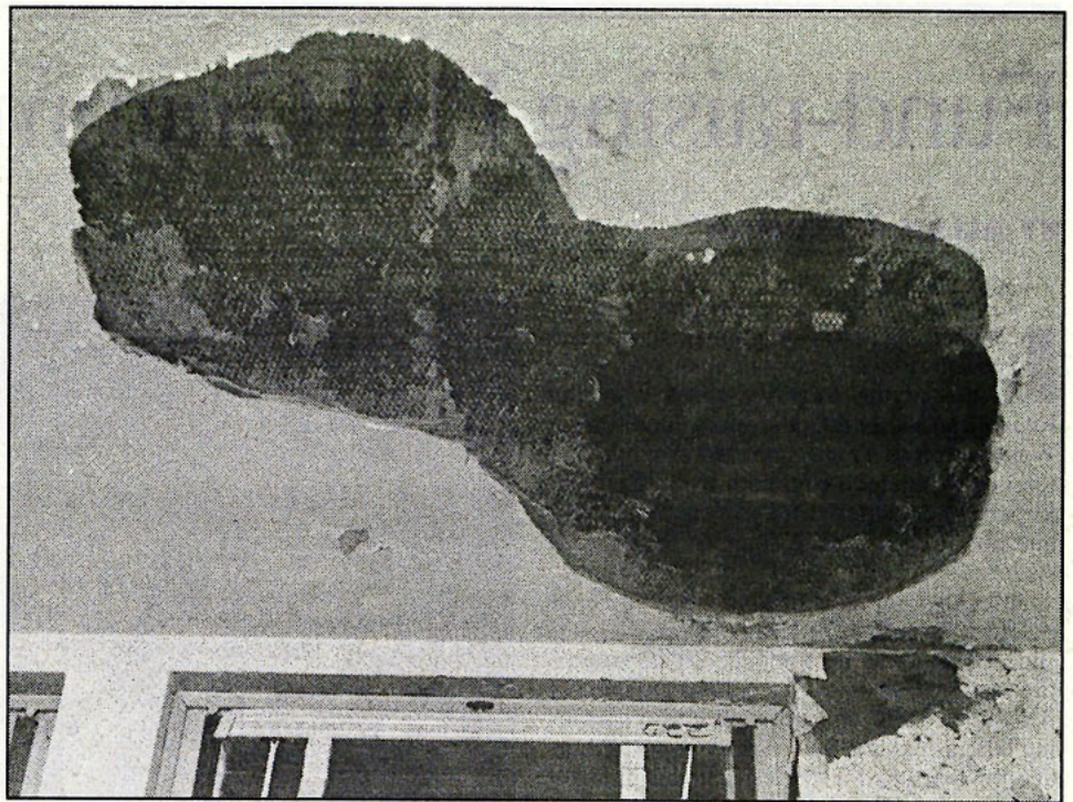
Library ceiling at Brownsville intermediate school, 1986.