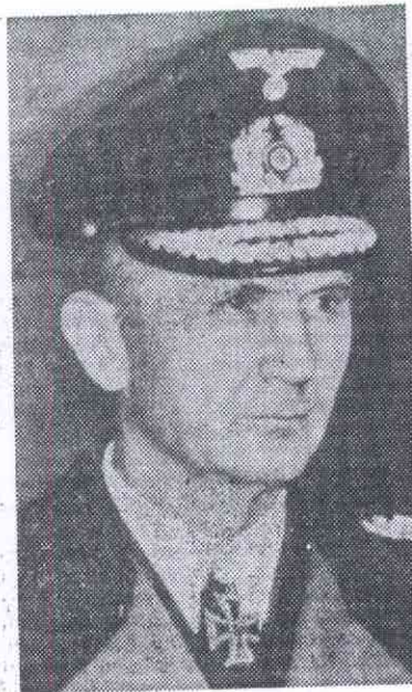
ADM. KARL DOENITZ ... his messages cost Germany subs

"Experimental stations in and out of the navy are working to improve your arms and instrument equipment.