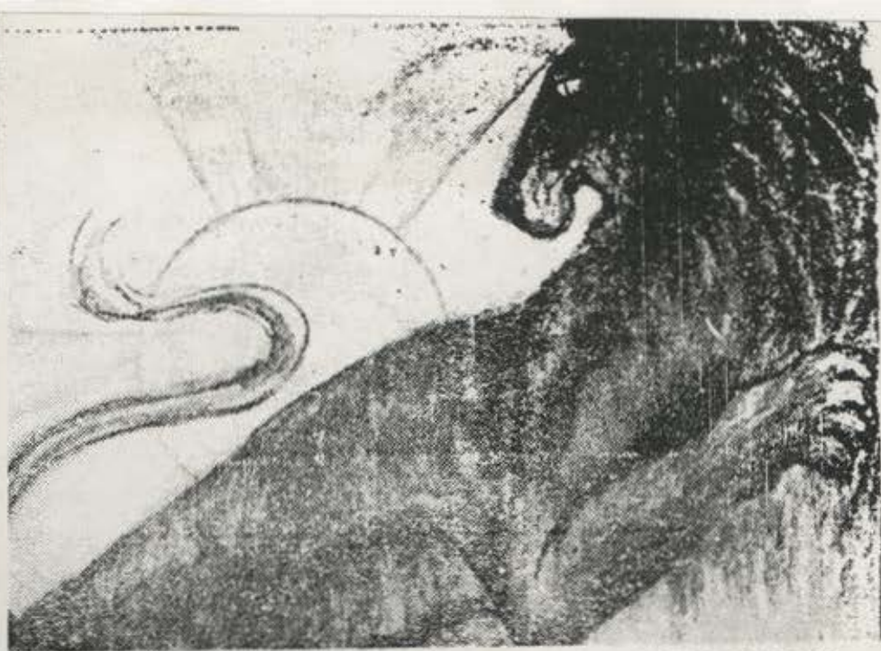
THUNDER IN THE HILLS (1978)