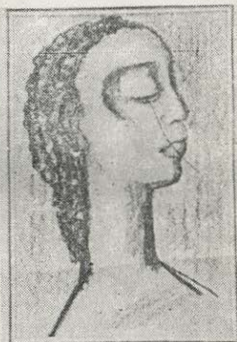
WOMAN (Charcoal on paper, 1978)