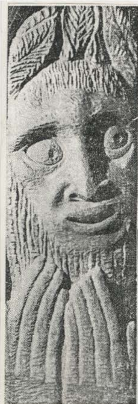
FAUN (Mahogany, 1972)