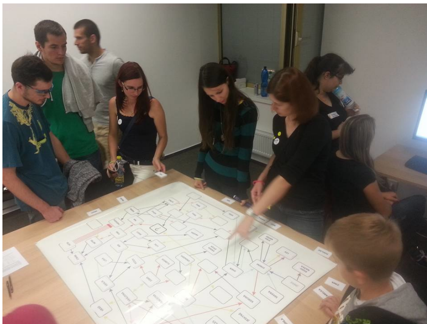
Fig. 2: Word games during European Researchers' Night.

describe the tasks of NLP research and explain them using tools that people use in everyday life [1,2], e.g. spelling checkers, predictive typing, voice recognition, or machine translation. When presenting research results or NLP tools to public, try to use visually appealing graphical representation as much as possible. Not just to attract attention of the audience, but mainly because the information presented with the help of pictures enhance the chance of remembering [3,4]. For example, see visualization of named entity recognition in Figure 1.