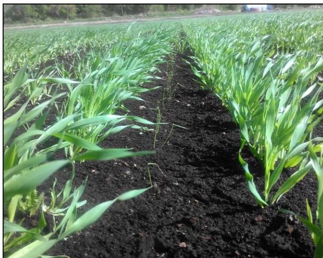
Figure 3: Barley wind breaks protecting onion seedlings from damaging wind.