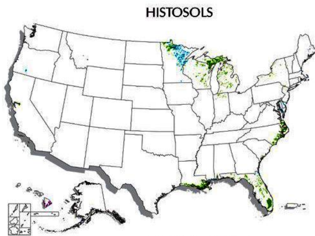
Figure 1: Distribution of muck soils in the United States and New York.

Soil scientists use the term “histosol” to categorize muck soils with high (20 to 50% or more) levels of organic matter (Figure 1).