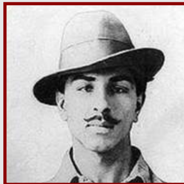
Bhagat Singh (1907-1931)

Launched Satyagraha against racism in South Africa at 25, became a Mahatma at 49