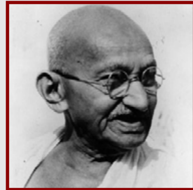
Mahatma Gandhi (1869-1948)

Launched Satyagraha against racism in South Africa at 25, became a Mahatma at 49