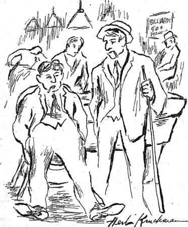
"Yeah—the tried to make a man out of me; she gimme books to read."