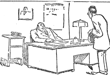
"I'm terribly sorry. Your scenario will do for Austria, but your grandmother doesn't suit Berlin."

sort to the boycott was initiated practically officially by the Nazi government when the anti-Jewish boycott of April 1, 1933, was ordered in Germany in alleged resentment of our natural, proper and justifiable publicly proclaimed indignation at Germany's "setting the clock back" and resorting to assaults on civilization not heard of in an allegedly civilized country since the Middle Ages. Naturally, this German boycott and the outrageous persecutions of which it was an incident, in time gave rise in our own country to a boycott of Germany, participated in by some American Jews and their sympathizers, and by the American Federation of Labor as a unit. The shrewdness of the claim that we in this country have no right to concern ourselves with such barbaric medieval persecutions and discriminations as the Nazi regime is resorting to abroad, I have expressed at length in my pamphlet "The United States and German Jewish Persecutions - Precedents for Popular and Governmental Action." (New York, England, France and Holland and other civilized countries have publicly expressed similar indignation, popular and often governmental, and also the League of Nations officially.