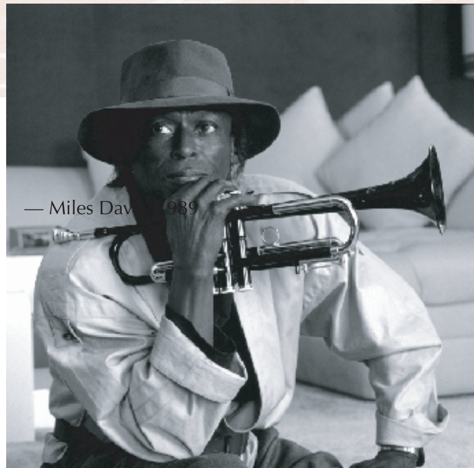
— Miles Davis, 1989

Artifacts courtesy of Miles Davis Properties, L.L.C.