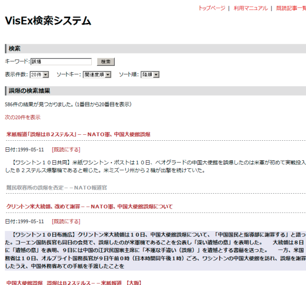
Fig. 1. Screenshot of TM2011 Interface

Figure 1 shows the screenshot of the interface of TM2011. An IAES Core is implemented as CGI with Ruby 1.8.7. When searching news articles, a user specifies the following parameters in addition to query terms: the number of retrieved articles per one page, sort key (score / release date), order (ascending / descending). These parameters can also be specified with the baseline system. Each entry in a retrieved result consists of release date, article title, and snippet of an article. Clicking the title displays the entire contents of the article in the same way as the baseline system.