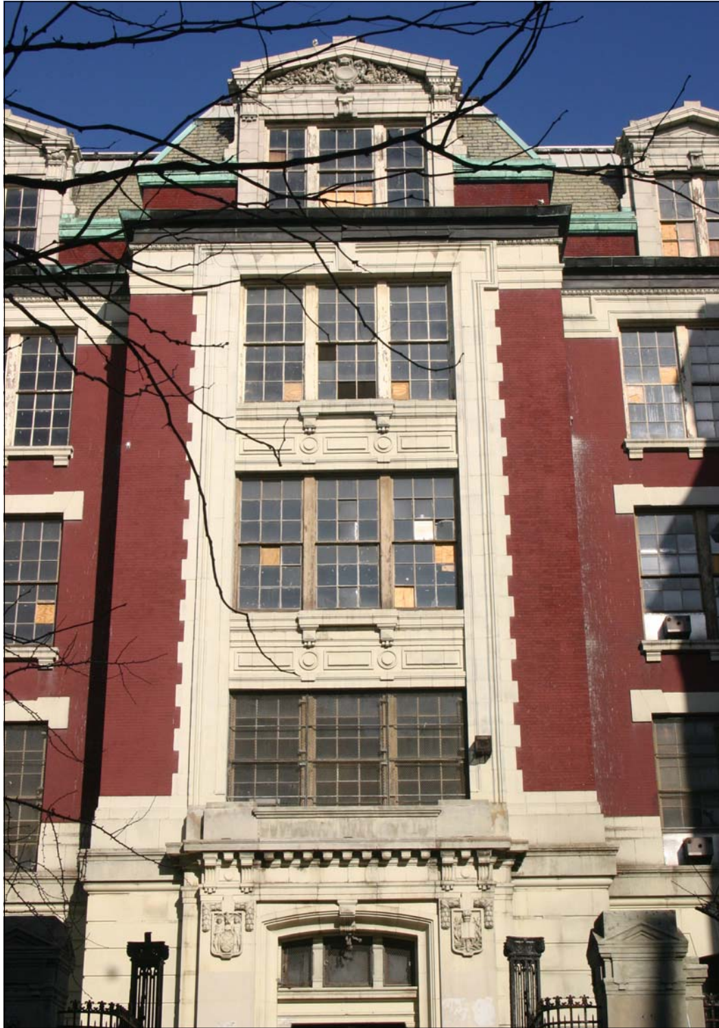
(Former) P.S. 64 East 9th Street Façade