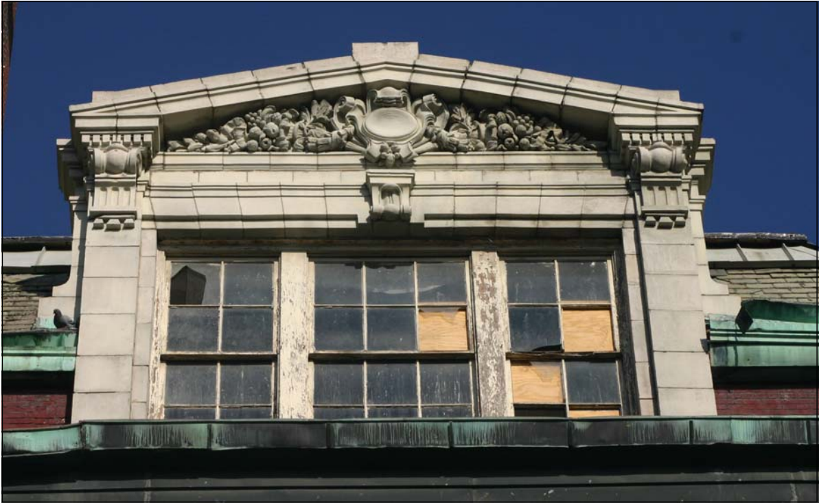
(Former) P.S. 64 East 9th Street Façade Details