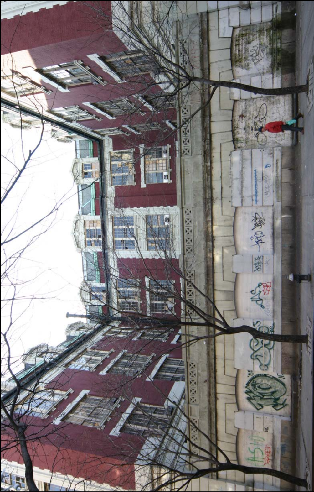
(Former) P.S. 64 East 10th Street Façade