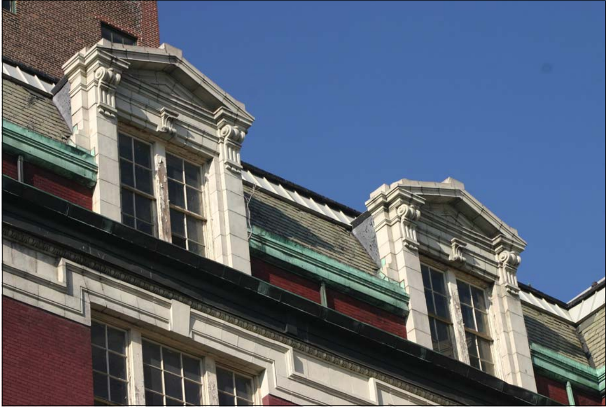
(Former) P.S. 64 East 9th Street Façade Details