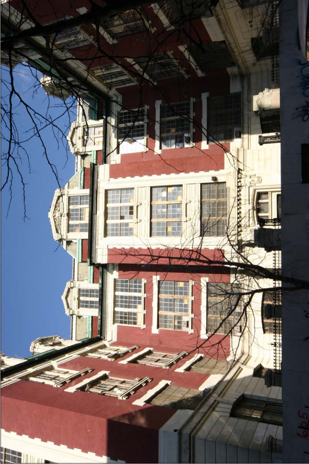
(Former) P.S. 64 605-615 East 9th Street aka 350-360 East 10th Street, Manhattan East 9th Street Façade