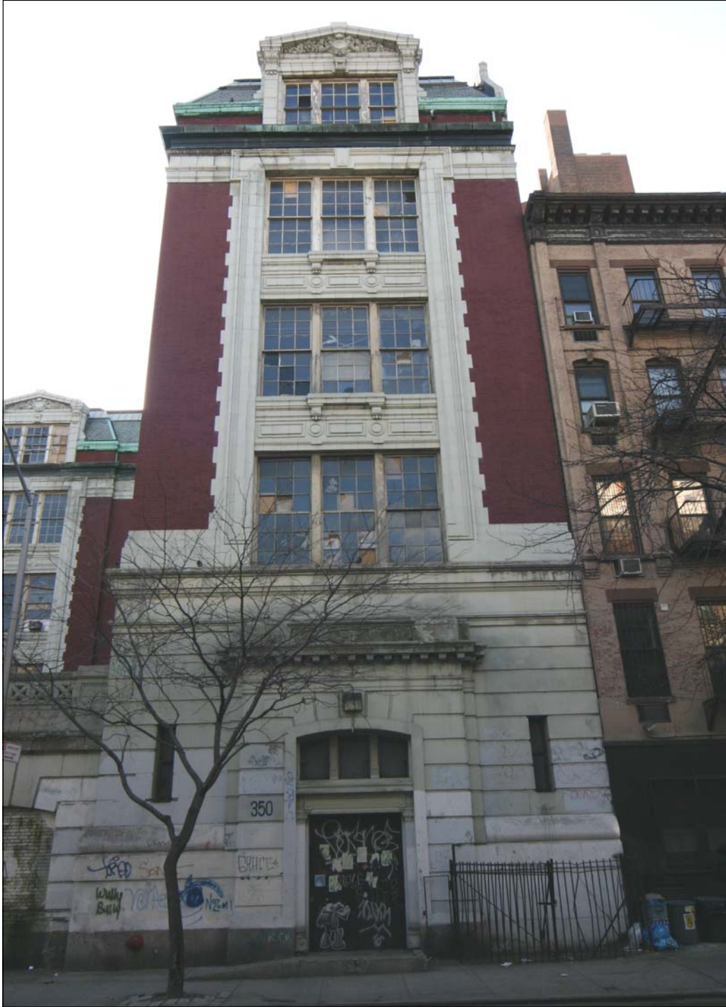
(Former) P.S. 64 East 10th Street Façade