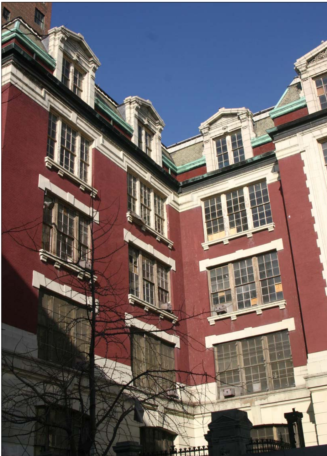
(Former) P.S. 64 East 9th Street Façade