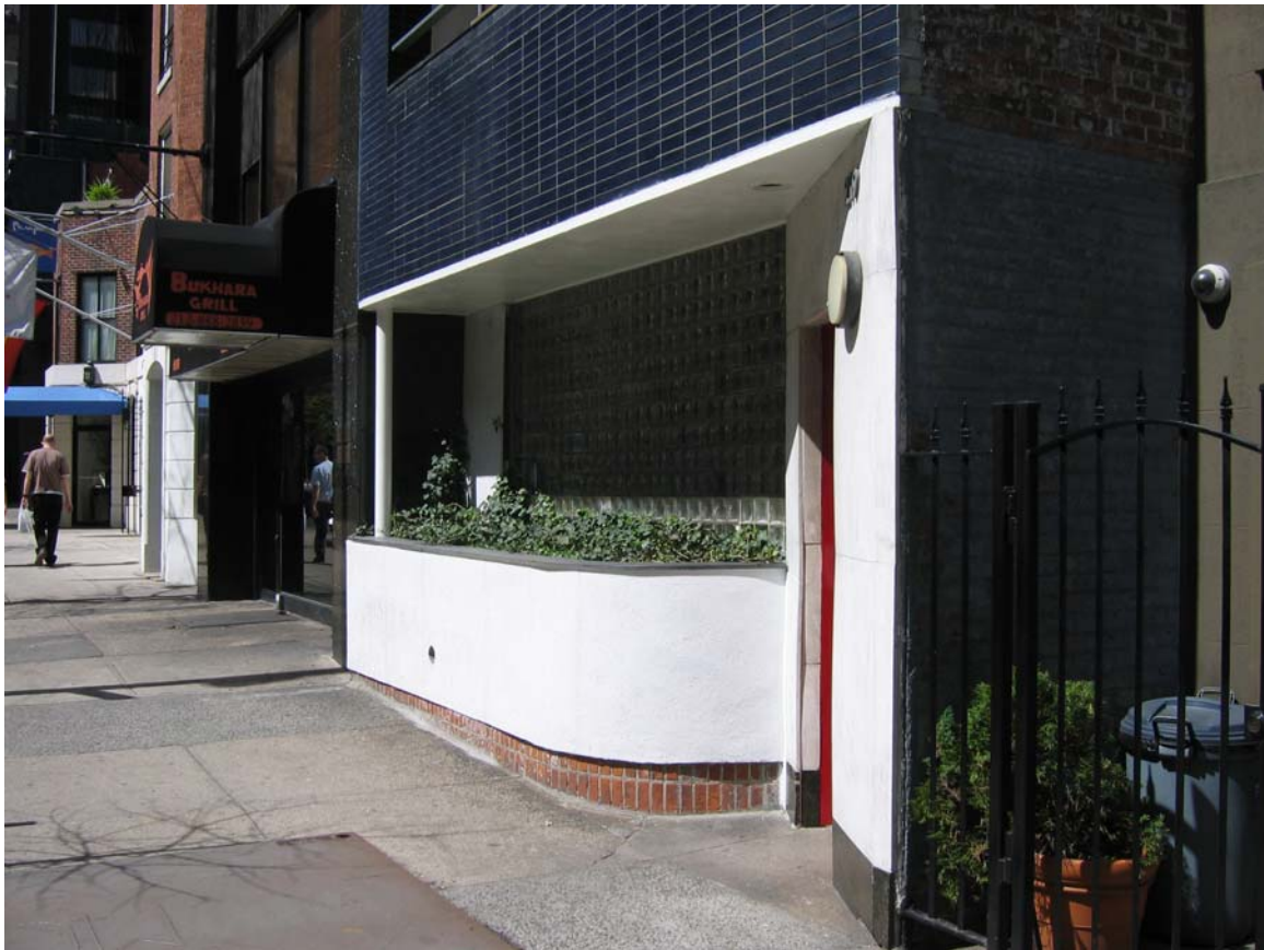
Morris B. Sanders Studio & Apartment