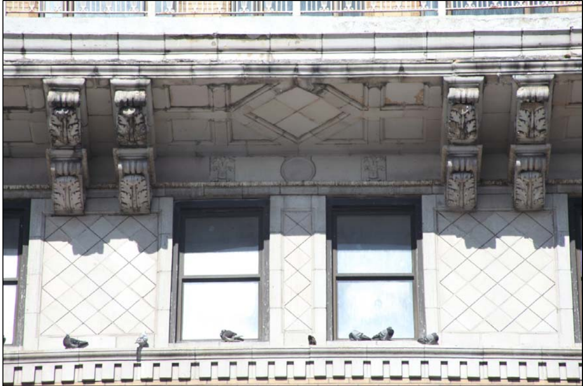
Coney Island Theater (later Shore Theater) Building Terra-cotta details Photos: Christopher D. Brazee, 2010