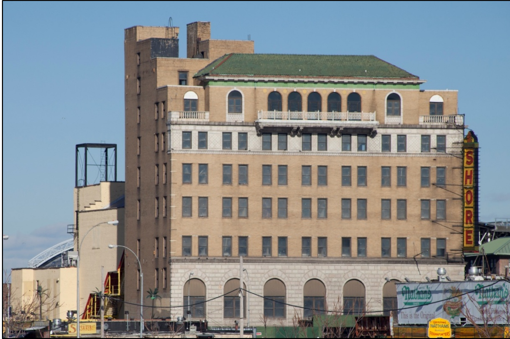
Coney Island Theater (later Shore Theater) Building Surf Avenue facade and details