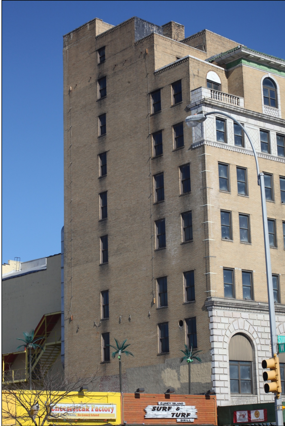
Coney Island Theater (later Shore Theater) Building Western facade of office building Photo: Christopher D. Brazee, 2010