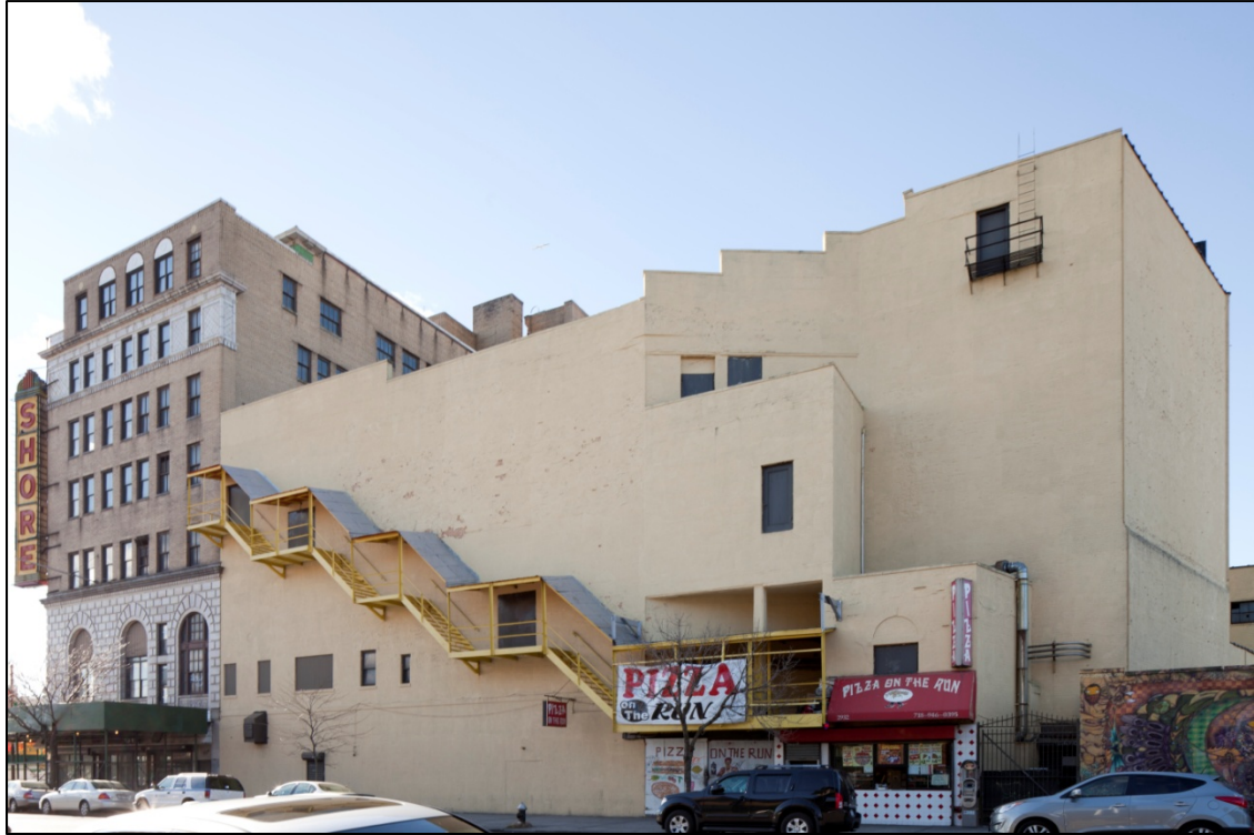
Coney Island Theater (later Shore Theater) Building East and north facades of theater box