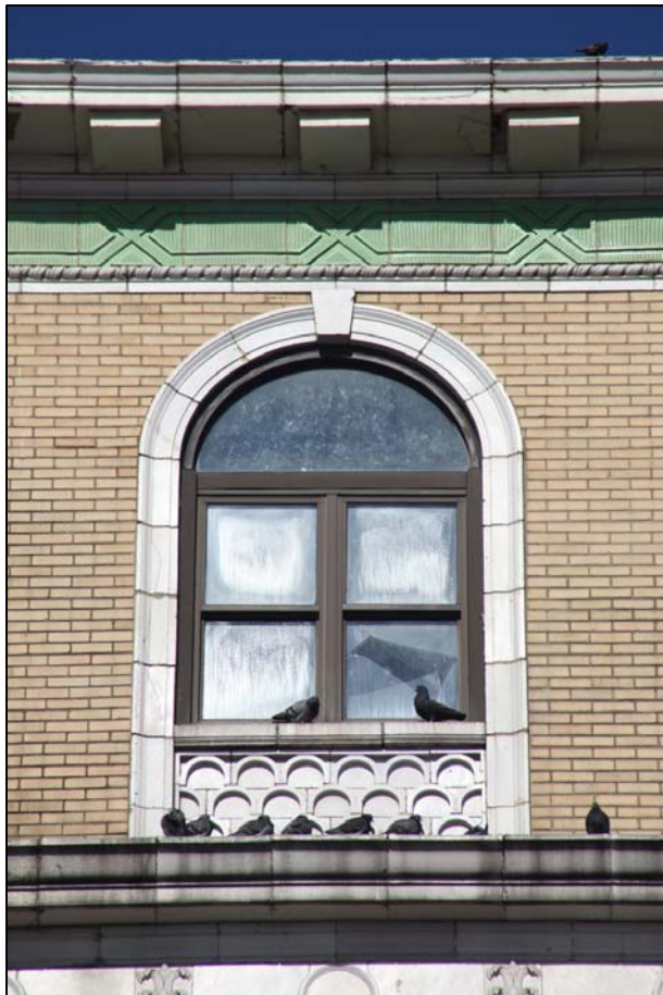
Coney Island Theater (later Shore Theater) Building Stone, and terra-cotta details Photos: Christopher D. Brazee, 2010