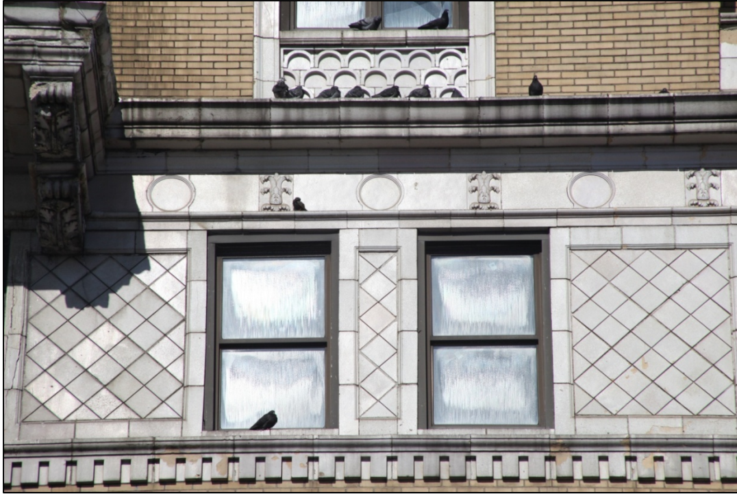
Coney Island Theater (later Shore Theater) Building Brick and terra-cotta facade details Photos: Christopher D. Brazee, 2010