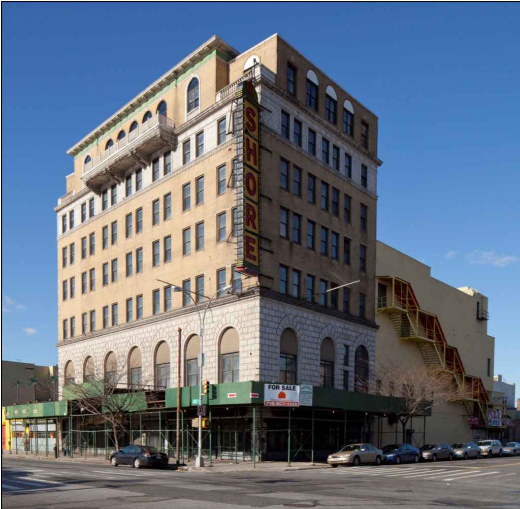
Coney Island Theater (later Shore Theater) Building 1301 Surf Avenue (aka 2932-2952 Stillwell Avenue) Brooklyn Borough of Brooklyn Tax Map Block 7064, Lot 16