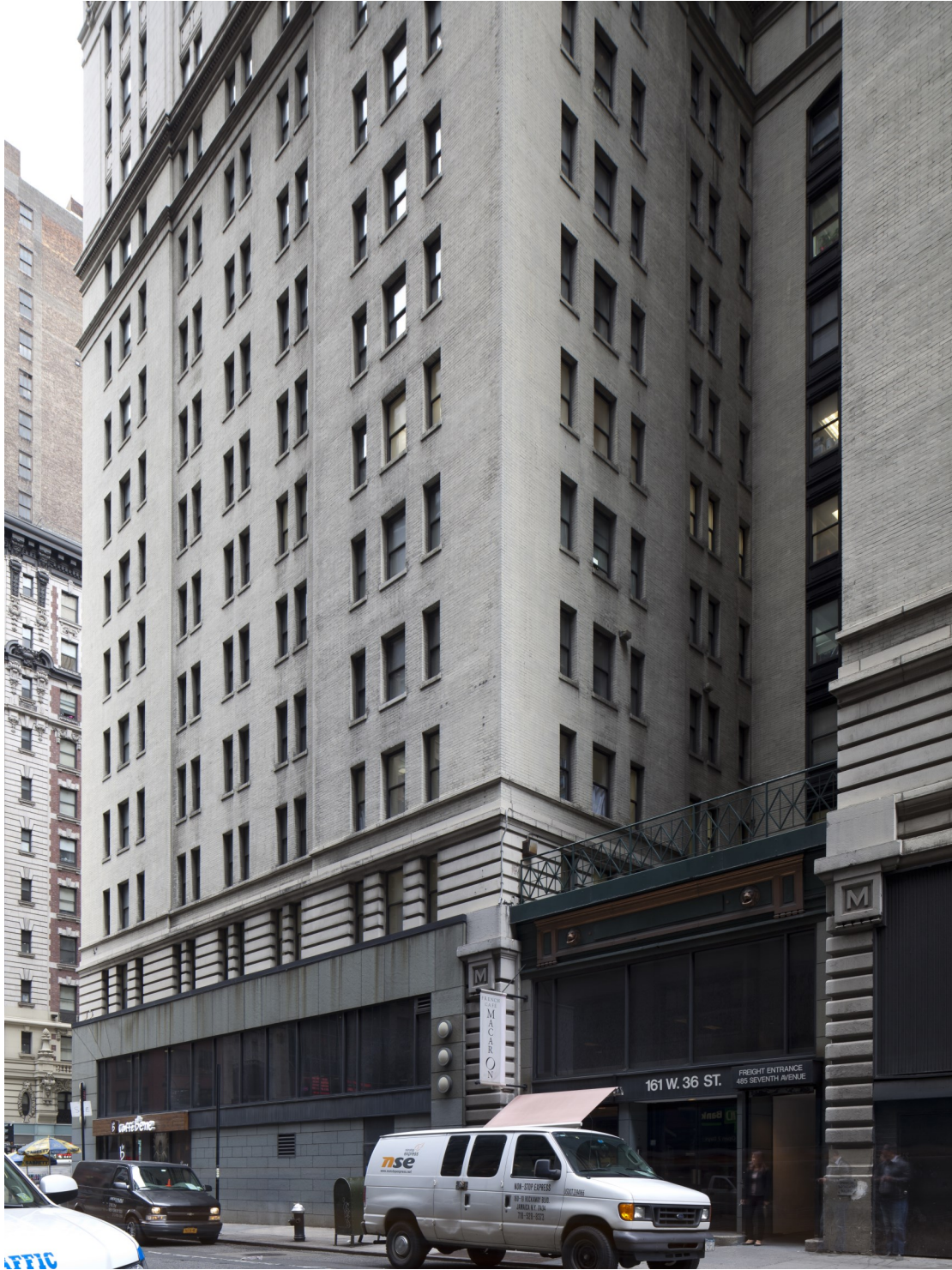
Mills Hotel No. 3 West 36th Street Facade Photo: Christopher D. Braze, October 2014