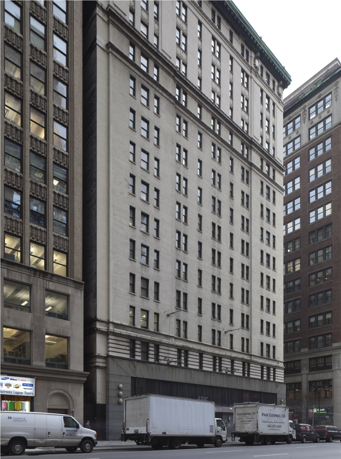
Mills Hotel No. 3 Seventh Avenue Facade