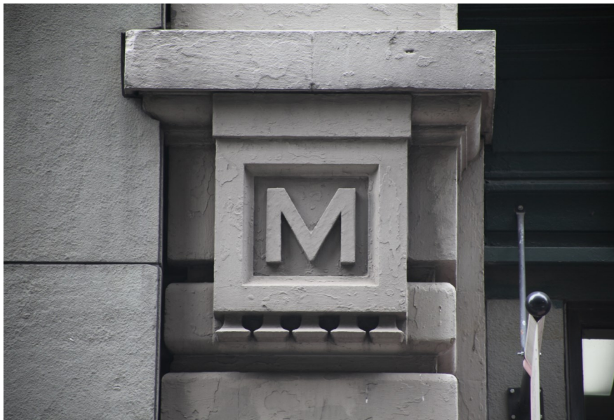
Mills Hotel No. 3 Detail Upper Stories and Cornice Photo: Christopher D. Brazee, June 2012 Detail West 36th Street Entrance Surround Photo: Christopher D. Brazee, May 2010