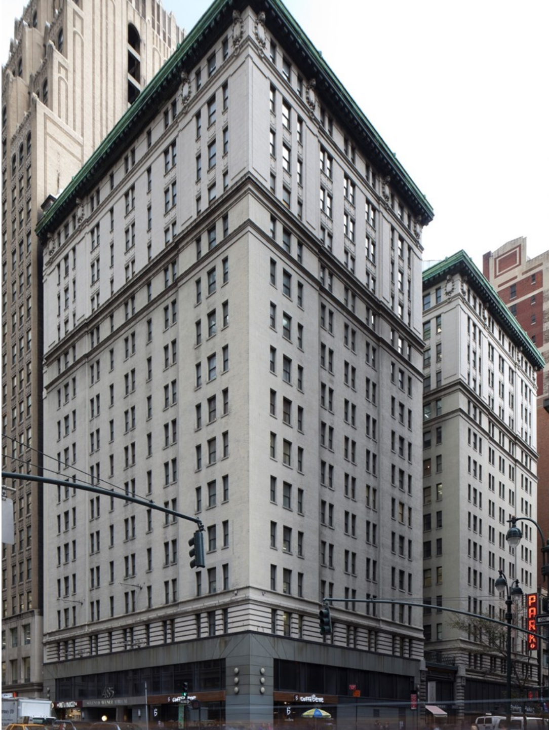
Mills Hotel No. 3 485 Seventh Avenue (aka 481-489 Seventh Avenue, 155-163 West 36th Street) Borough of Manhattan Tax Map Block 812, Lot 1 Photo: Christopher D. Brazee, October 2014