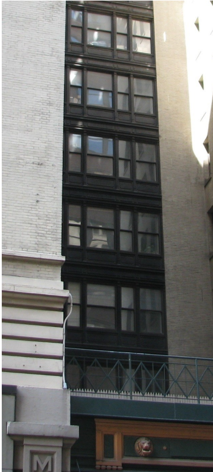
Mills Hotel No. 3 West 36th Street Light Court Photo: Gale Harris, May 2010