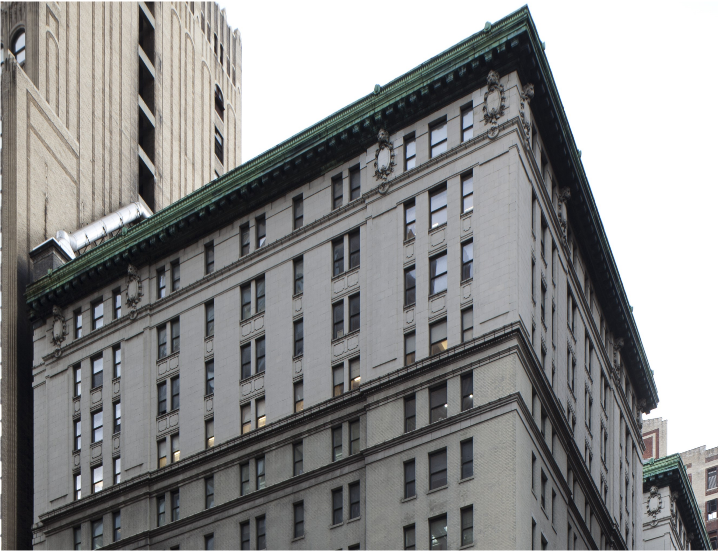
Mills Hotel No. 3 Upper Stories Seventh Avenue Facade Photo: Christopher D. Brazee, October 2014