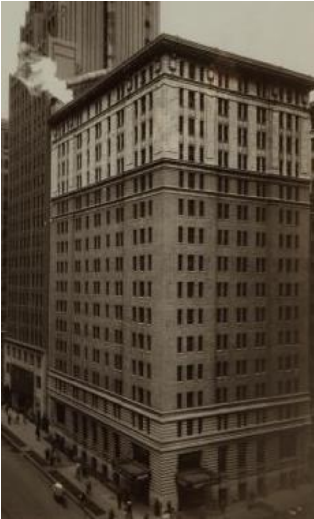
Mills Hotel No. 3 1940s