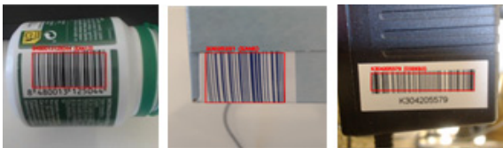
Figure 2: Examples of bar code reading by the developed system.

As mentioned in the previous section, the interaction with the user uses image to sense a human face approaching, its gender (male, female) and feeling (positive, negative, neutral). The same camera is also used for reading the product barcode. The barcode reading process allows to read most barcode formats, as shown in Figure 2.