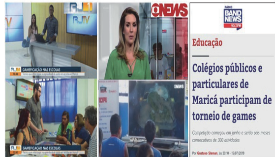
Figure 1: National and local media coverage.

it was required that every school had at least, one school director directly involved in activities, which could indicate a non-voluntary participation. In relation to neighbours, they were the least involved as perceived by teachers, although it is worth considering who they considered neighbours, as 50% of teachers perceived a lot of parent's involvement.