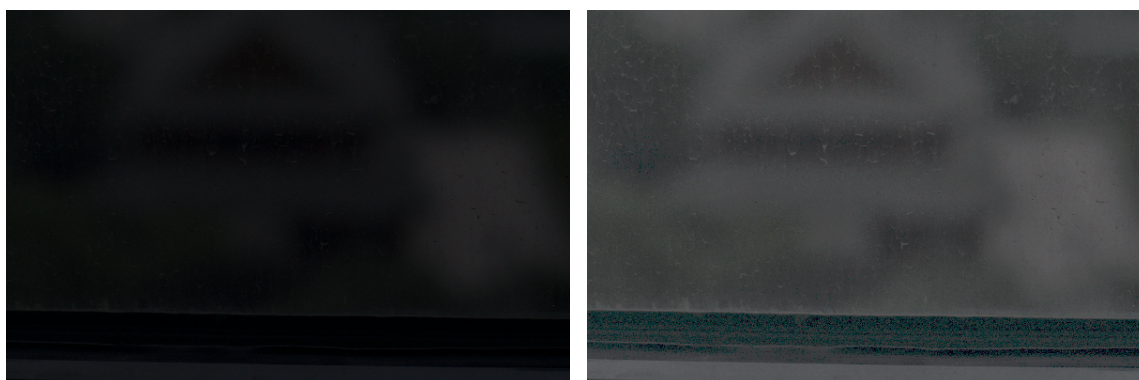
(a) The original raw image.