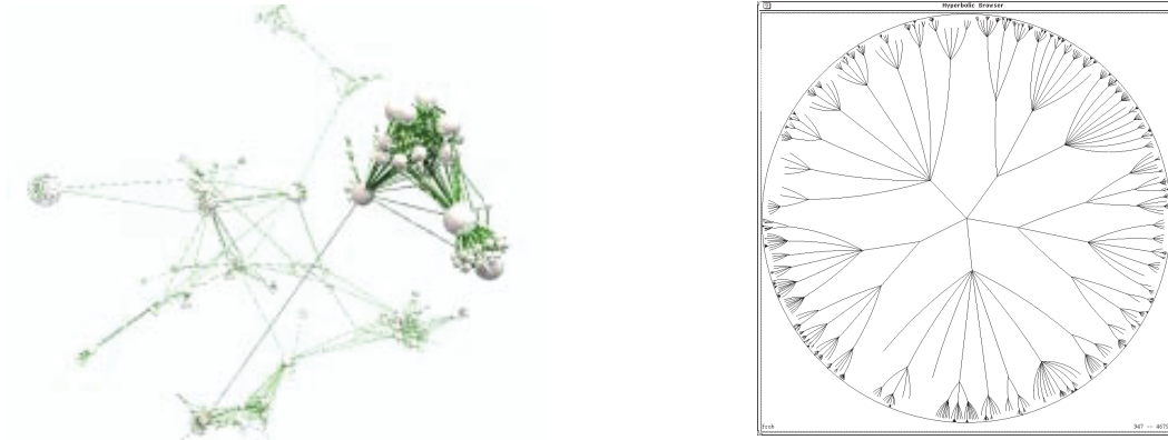
(c) Narcissus: Representation of complex web structure of a collection of web pages in Narcissus, in which each node is a webpage, each link a reference relationship. The large nodes are indexes into the pages, and the ball-like structure represents the set of cross-referenced pages [22]. (d) Hyperbolic tree: This Hyperbolic tree, located in the center of the space, has all its offsprings in the hyperbolic plane hierarchically, and clearly shows the layout of a tree with 1004 nodes [31].