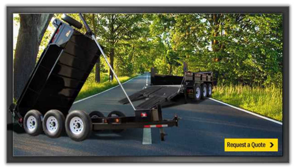
Illustration 7: 7 tonne payload dump trailer

Unless intermediary storage is found in existing structures at very low cost, it is not recommended to invest into its construction since it is inherently inefficient and can lead to additional contamination of the fuel.