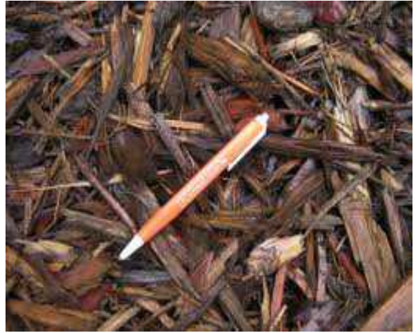
Illustration 2: Low quality hog fuel