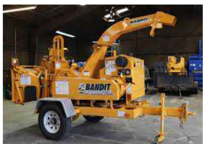
Illustration 5: Mobile diesel powered chipper

It is highly recommended to test any chipper with the feedstock available before purchase.