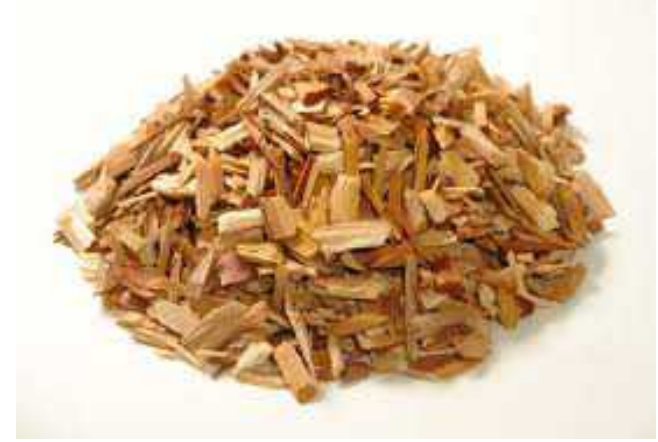
Illustration 1: High quality wood chips

Ideally, a wood chip is "chunky" and of mostly uniform size, this improves both handling and combustion characteristics.