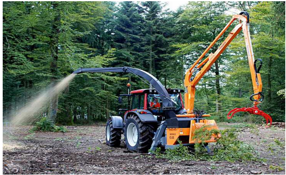
Illustration 6: Tractor PTO powered chipper with feeding attachment