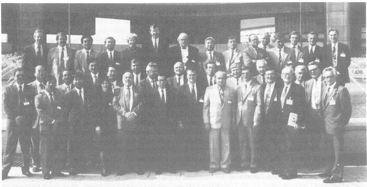
Participants of the First ITER EDA Council Meeting, Vienna, Austria

The Council decided that the IC-2 meeting will take place in Moscow on 15-16 December 1992. The Council also decided that IC-3 and IC-4 will take place on 21-22 April 1993 and 27-28 October 1993, respectively, and IC-5 tentatively in March 1994. The locations for each meeting will be determined at the previous meeting. It was understood that Japan had offered to host IC-3, the United States of America IC-4 and the European Atomic Energy Community IC-5.