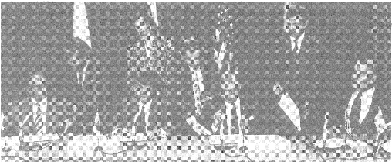
Senior Representatives of the ITER Parties signing the Agreement

This ceremony, which was videotaped, represented the culmination of years of effort by many persons who had prepared the texts of the Agreement and Protocol 1, reviewed the texts for the Parties and finally those who negotiated the final understandings leading to the signature authority granted by each Party.