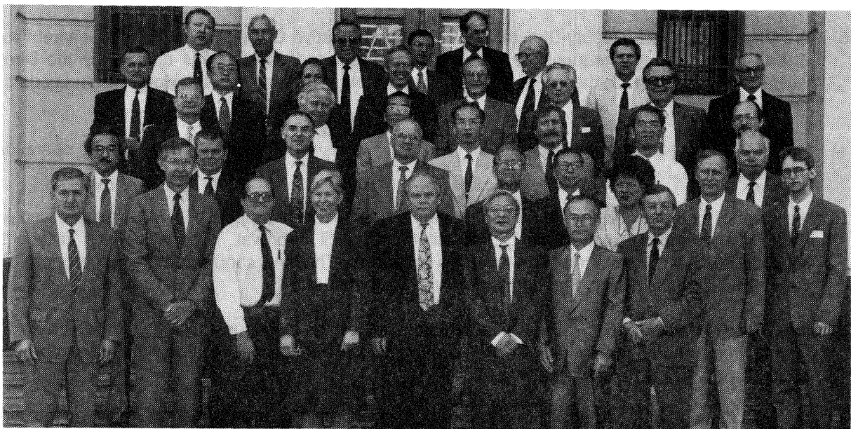
Participants in the Meeting

The Council noted that there is a need for periodic design reviews of the ITER systems as they are defined and refined over the remainder of the EDA and charged TAC with this task.