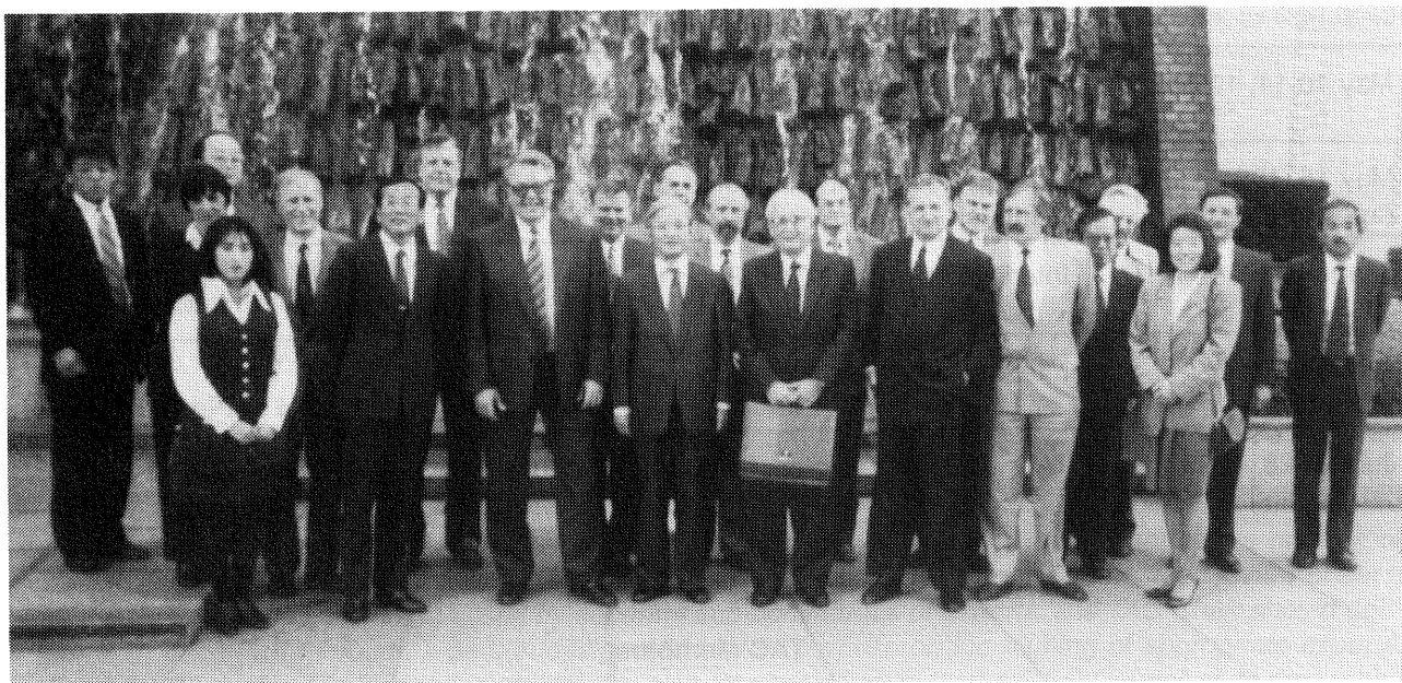
Participants in the Meeting