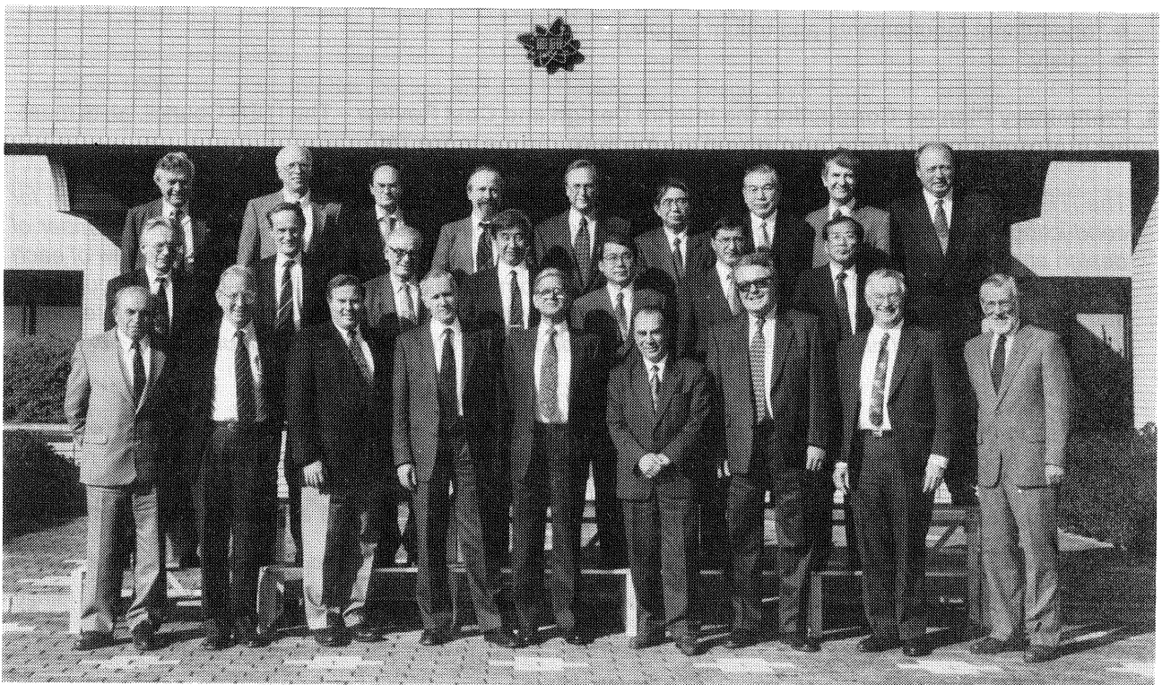
Participants in the Meeting

A Design Assessment Meeting was held at the JWS San Diego on 17–28 October 1994, involving broad participation from the Joint Central Team (JCT) and the four Home Teams (HTs). The assessment covered all major systems, including safety, vacuum vessel and cryostat, shielding blanket, divertor and plasma-facing components, magnet system and related plasma control, reactor building layout, tritium, assembly