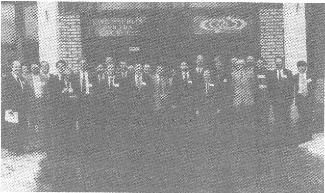
Participants in the Meeting