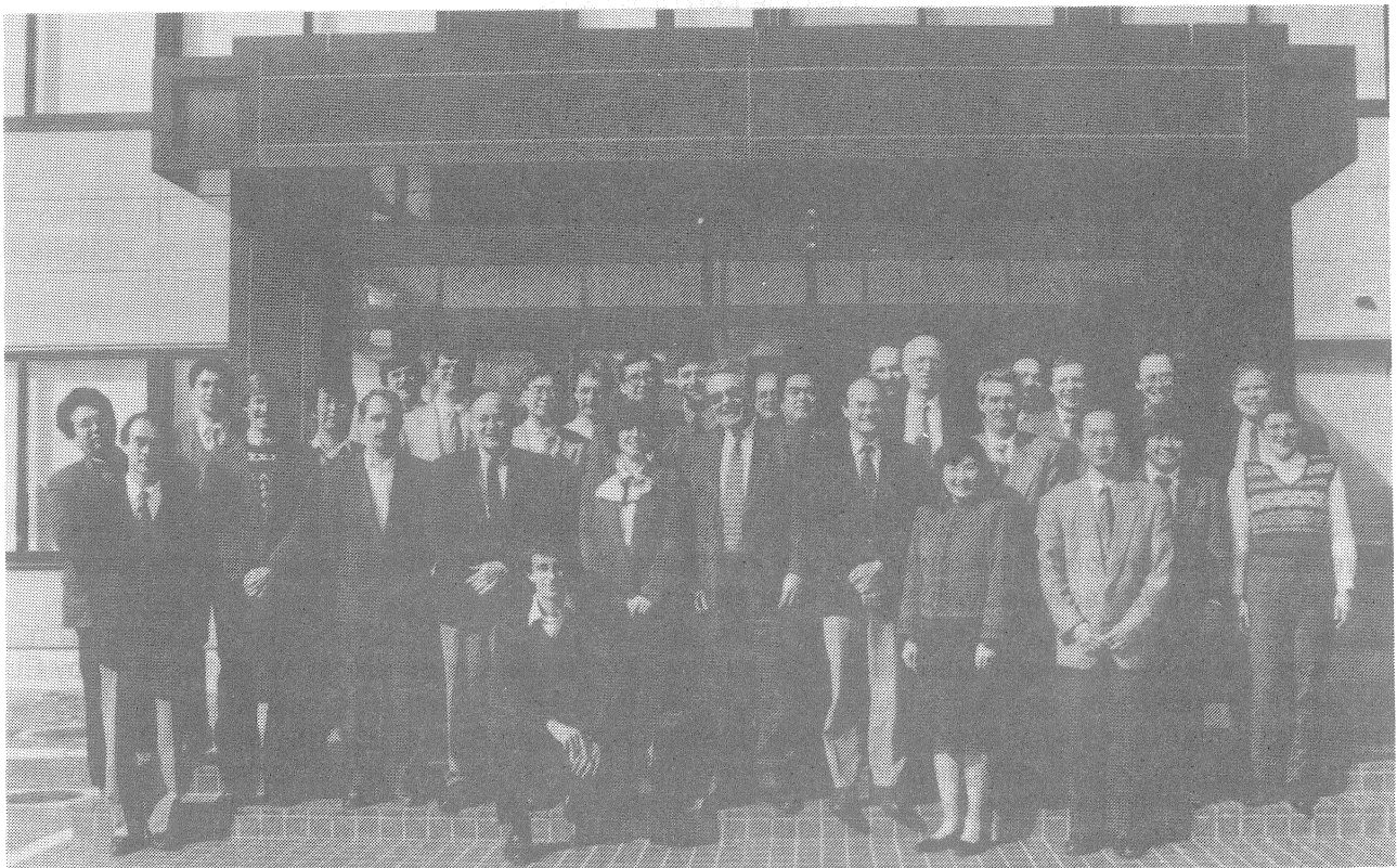
Participants in the Meeting

The reference design will be based on a bucked TF/CS configuration. The reference TF coil cross-section will be the cased coil with radial plates containing thin walled tubular jacketed conductors in grooves. The global support structure to be developed as reference will be the "crown" concept without inboard shear keys between TF coils and with outer intercoil structural components.