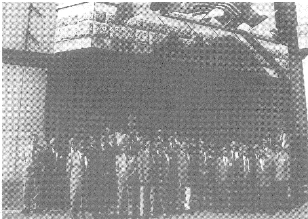
Participants in the Meeting

On the occasion of the meeting, each Party made a significant move forward by announcing its readiness to enter non-committal, pre-negotiation, exploratory discussions called Explorations, aimed at identifying issues for subsequent Negotiations toward a possible ITER construction, operation, exploitation and decommissioning and identified its Explorers (see the list on the next page). These Negotiations would hopefully allow the start of construction without any unnecessary hiatus after the present EDA.