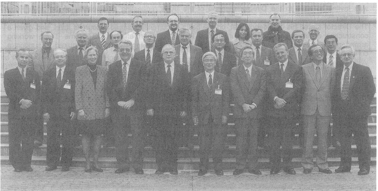
Participants in the Meeting

The Delegations heard the Director's report on the current situation with ITER, including progress on design of the Reduced Technical Objectives/Reduced Cost Option. The Director stressed the need for clear expressions of intent by the participating Parties to move toward future construction decisions in order to create a constructive environment for effective continuation of ITER activities. In response, the EU, JA and RF Delegations re-affirmed that, in line with the reactor-orientation of their fusion development programmes and the centrality of ITER in these strategies, they remain committed to progress toward possible future decisions on the realization of ITER. The US Delegation restated its wish to see ITER built.