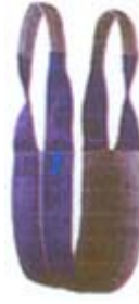
Pipe sling with reinforced eyes