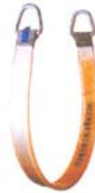
Lifting Sling with SECUTEX coating and steel end fittings