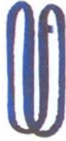
Endless roundsling basket lift