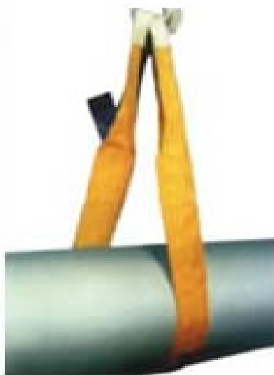
WEBBING BELT FOR SLING