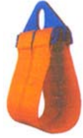
Lowering-in belt with ram's head fitting and plates