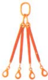
Multi-leg roundsling system with high-duty steel end fittings