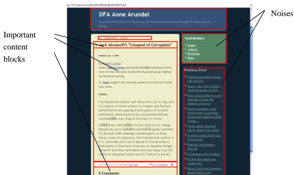
Figure 2. Segmentation of a sample blog page

The first step in important content block detection method is page segmentation. The segmentation method used in our system is based on VIPS [1][3]. There are several methods which are based on DOM tree [4][5][6]. These methods use DOM tree parsed from HTML file to find important tags and use these important tags to segment pages. But pages have many visual structures, especially in blog pages, see Figure 2. DOM tree can reveal only tag structure rather than these visual layouts information. VIPS can make full use of the visual features of pages such as font, color and size. Figure 2 gives a segmentation result for a blog page. We can see that the whole page is segmented into several individual blocks. In each block, content is almost unified. After segmentation, a block tree is built for each page. Each block except leaf node has a parent block node and several child block nodes. From each node in this block tree, we can extract some features including layout features and language features. By using SVM classifier and some heuristic rule, we can identify whether each node being content or noise. When we use VIPS method, we can set the value of segmentation level (pDoc). In our systems, we set this value was 8.